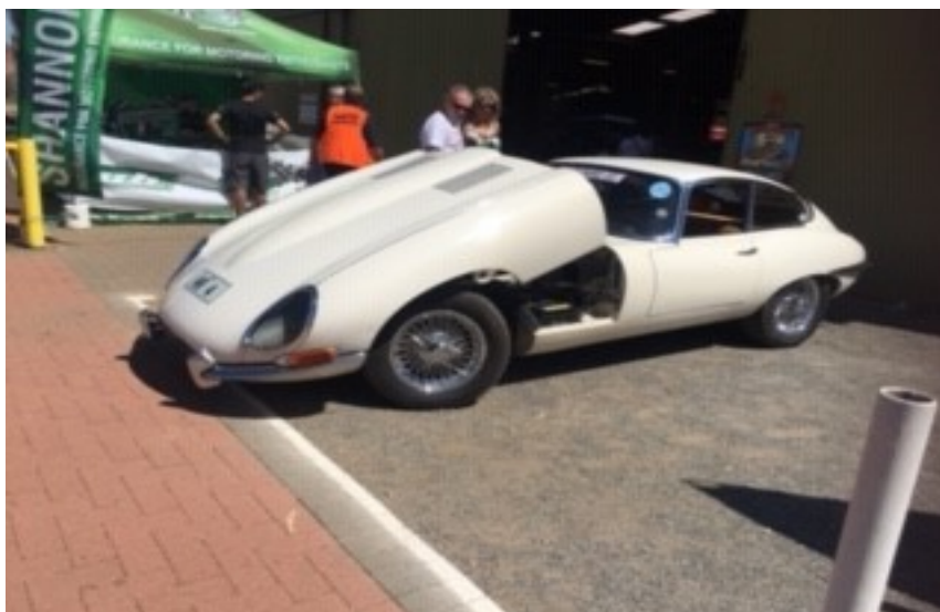
Sam Salmon's 'E' type Jaguar