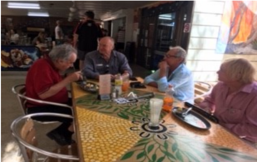
Lunch Table 37