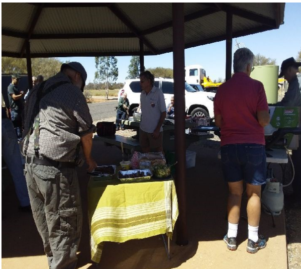
The cooks and BBQ table ready for distribution - Yummy