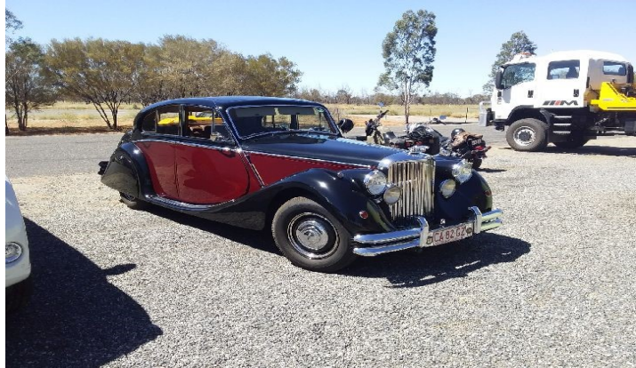
Russ and Liz's Isuzu Truck in back ground