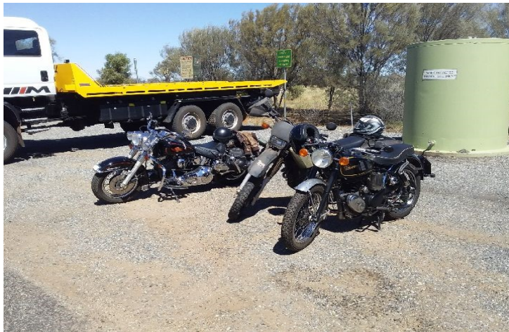
The motorbike brigade