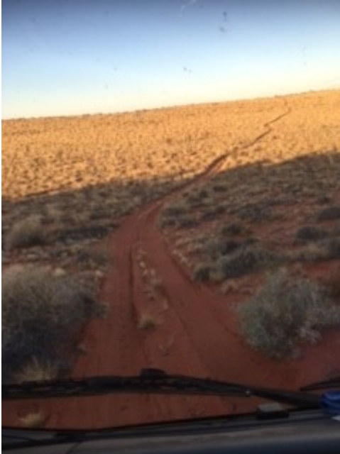
The Madigan track as far as you can see and no one else in sight

We slept in the next morning and then the dastardly job to unload the truck, put everything away and try to get back into civilized mode.