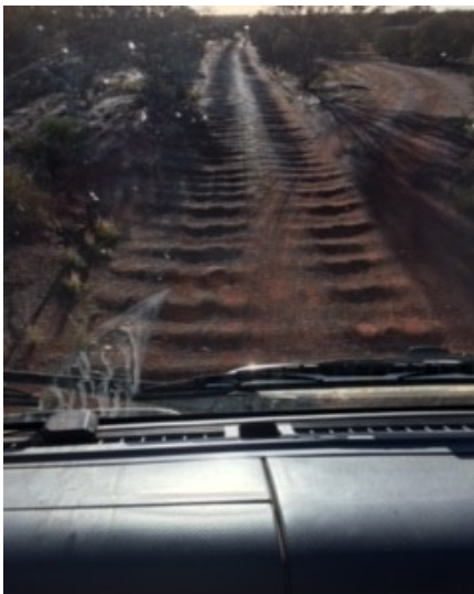
Corrugations and lots of them - mean ones