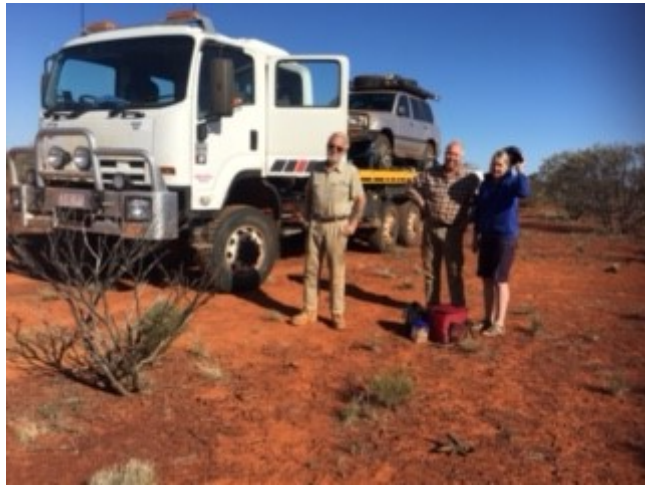
Found our happy customers all loaded and ready for trip home