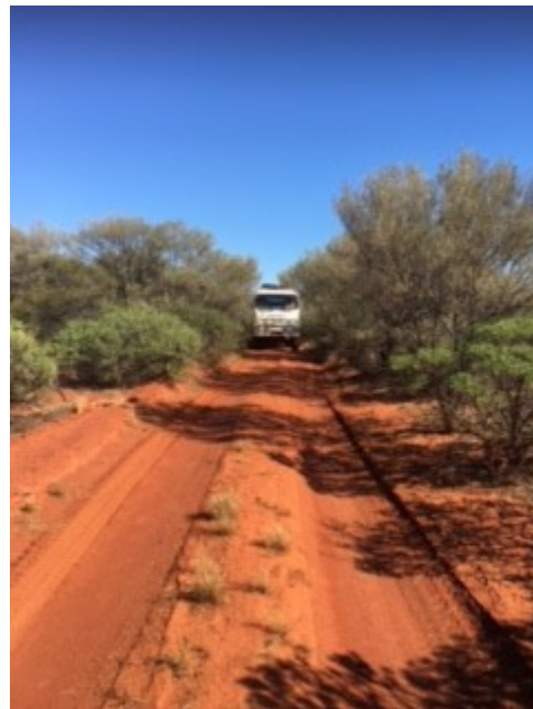
Pin stripping for free whether you want them or not