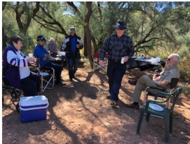
Table at site under the coolabah trees (well I guess gum trees), perfect day sun was shining, cooler in the shade with only a couple of friendly flies.

Full sized BBQ, snags, onions, hamburgers, pancakes, coleslaw salad, bread, sauces, maple syrup, cup cakes and of course tea and coffee