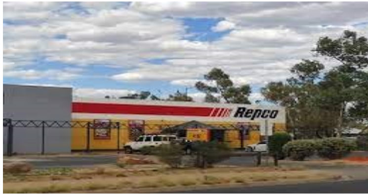
REPCO Alice Springs — For your car parts