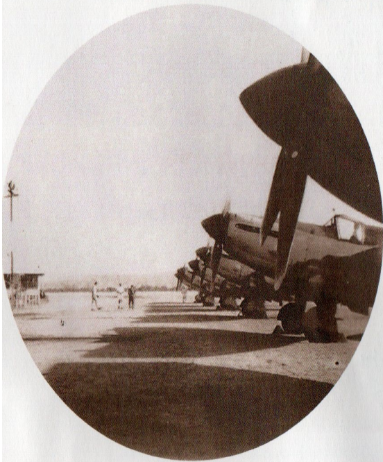
Spitfire Squadron on route to Darwin, 1942

The Australian National Aviation Museum Alice Springs members share a passion for Central Australian Aviation history, heritage and Australian Aviation generally.