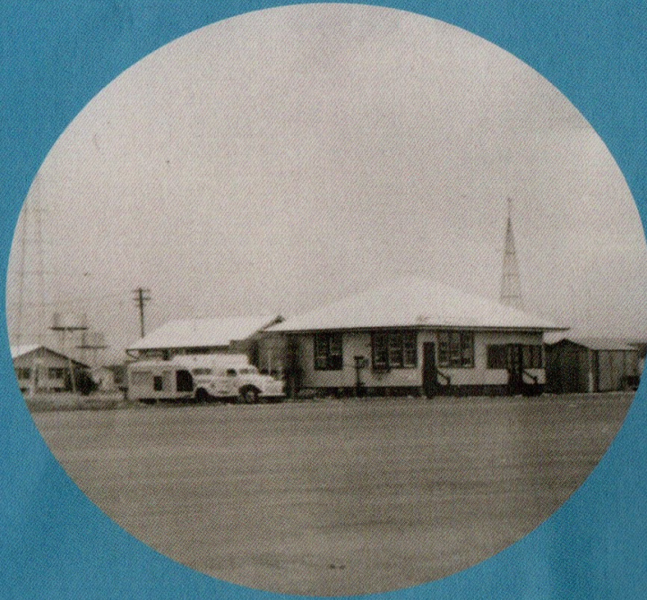
Aerodrome Circa, 1950*

Road movements along the Old South road and Rail on the old Ghan railway line are located right next to Seven-Mile Aerodrome. It was critical to maintain supply lines to the North, especially after Darwin was bombed.