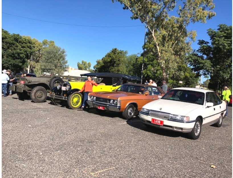
1/5/23 Bang Tail Muster