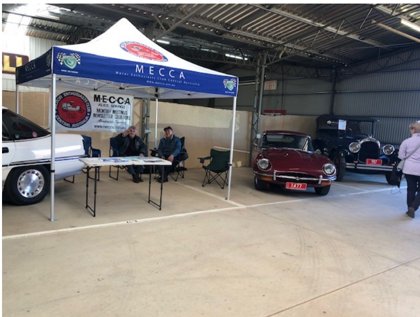
7th - 8th July 2023 Alice Springs Show Great members turnout