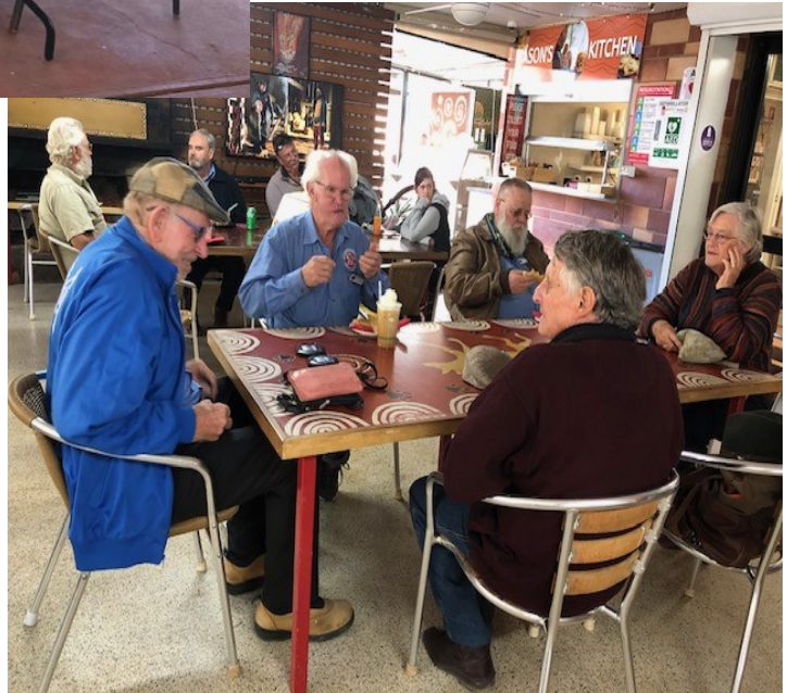
18/6/23 run to Standley Chasm - lunch—Yummy