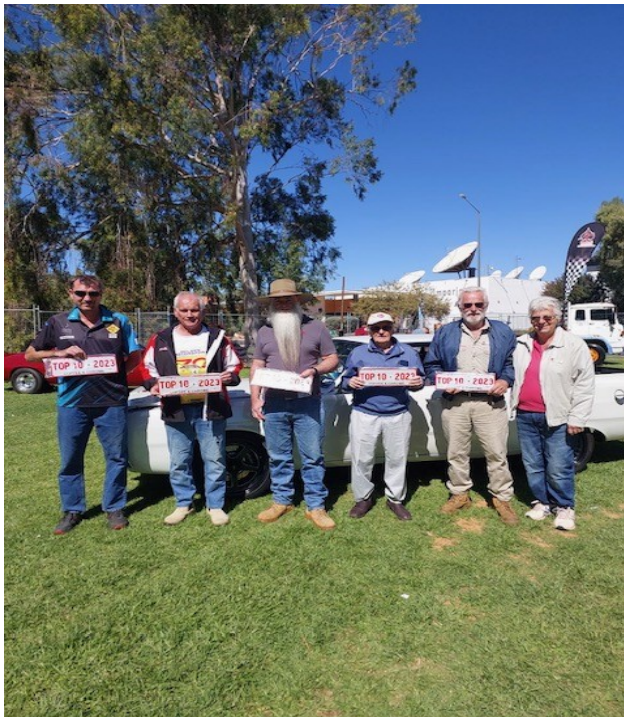
7/5/23 Aces and Eights Coffee & Chrome